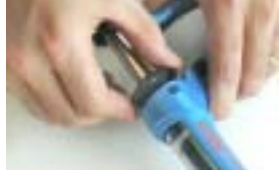
Unscrew the push rod guide and remove the cylinder.