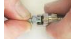
Loosen the needle nut and insert the needle, then re-tighten the needle nut.