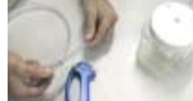
Place a spring over the other end of the feed tube and fit to the 'Cleaning Unit' if cleaning or to the container of solution to be used.