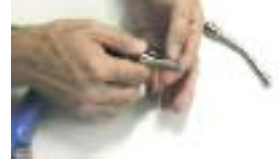
Unscrew the needle nut to release the needle.