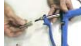
Ensure the inlet valve is inserted correctly, then screw on the dual barb inlet fitting.