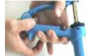
Push the handle whilst rotating the dose adjuster screw to set the dose. Tighten the dose adjuster lock nut to secure the dose setting.