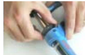
Re-insert the push rod into the handle and tighten the push rod guide to secure.