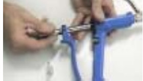
Remove the large barb inlet fitting - you may require pliers to do this.