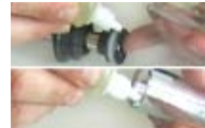
Lubricate the cylinder seal ring and the inside rim of the cylinder.