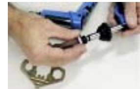
Fit the new piston washer and secure it firmly with the multi-tool.