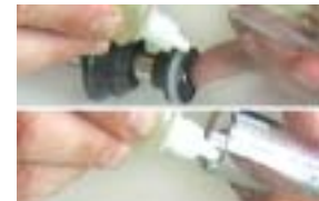
Lubricate the cylinder seal ring and the inside rim of the cylinder.