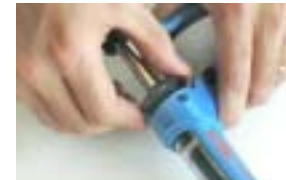
Unscrew the push rod guide and remove the cylinder.

CLEANING After use, flush the instrument and feed tube with a hot water detergent mix. Repeat using clean water only to remove any soap residue.