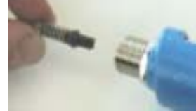
Ensure the delivery valve is inserted correctly.