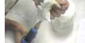
Ensure the instrument is set to maximum dose and pump the handle until the cylinder fills with solution. Hold the instrument vertically and depress the lever to expel any air bubbles.

WARNING: Care must be taken to ensure that the chemical being used does not come into contact with your body as it may cause injury.