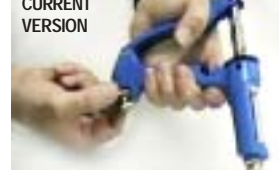
CURRENT VERSION Push the handle whilst rotating the dose adjuster screw to set the dose. Tighten the dose adjuster lock nut to secure the dose setting.