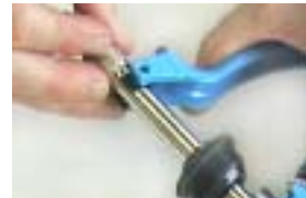
Re-insert the cylinder and push rod into the handle taking care to align the push rod grooves with the lever pads.