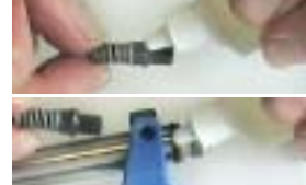
Remove the barb inlet fitting and lubricate the inlet valve seal ring and push rod seal ring.