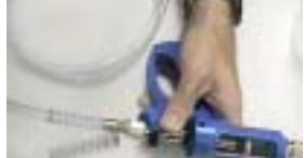
Place a spring over the feed tube and fit over the inlet fitting all the way up the barb. Rotate the spring anticlockwise - this opens the coils to allow movement.