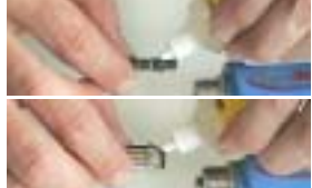
After cleaning, remove the nozzle and using castor oil, lubricate the inlet valve seal ring and nozzle seal ring.