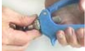
Hold the handle firmly and loosen the dose adjuster lock nut.