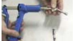
Unscrew the nozzle nut to release the sheep nozzle.