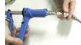
The injection attachment is fitted in the same way as the nozzle.