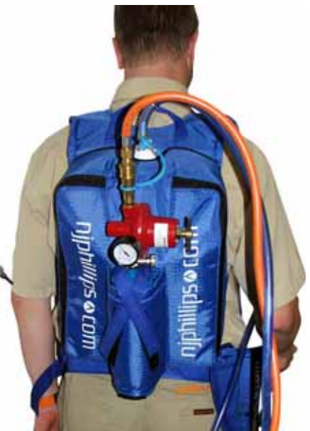
CLOSE-UP OF BACKPACK WITH POWERED OPTION