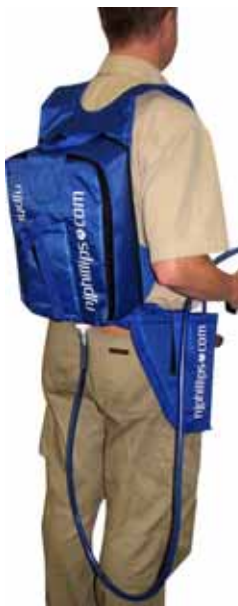
CONTAINER IN INVERTED POSITION