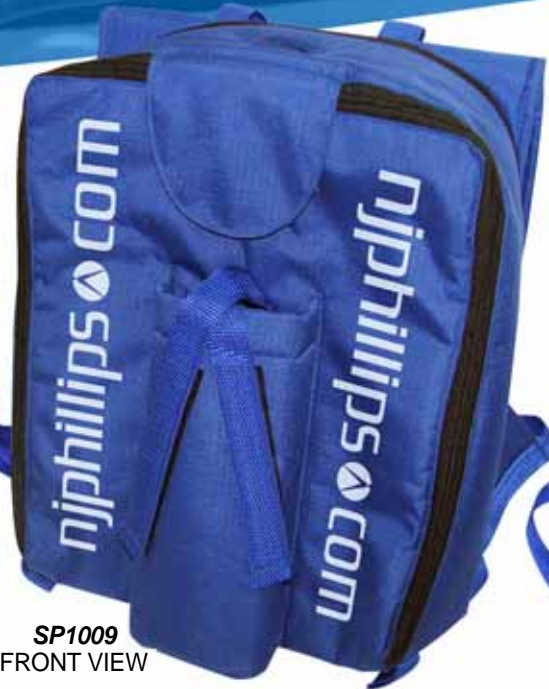
SP1009 FRONT VIEW