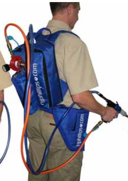
BACKPACK WITH POWERED OPTION