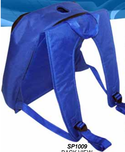
SP1009 BACK VIEW