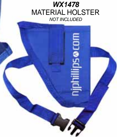
WX1478 MATERIAL HOLSTER NOT INCLUDED