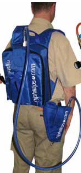
CONTAINER IN UPRIGHT POSITION