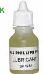
NJ PHILLIPS LUBRICANT INCLUDED