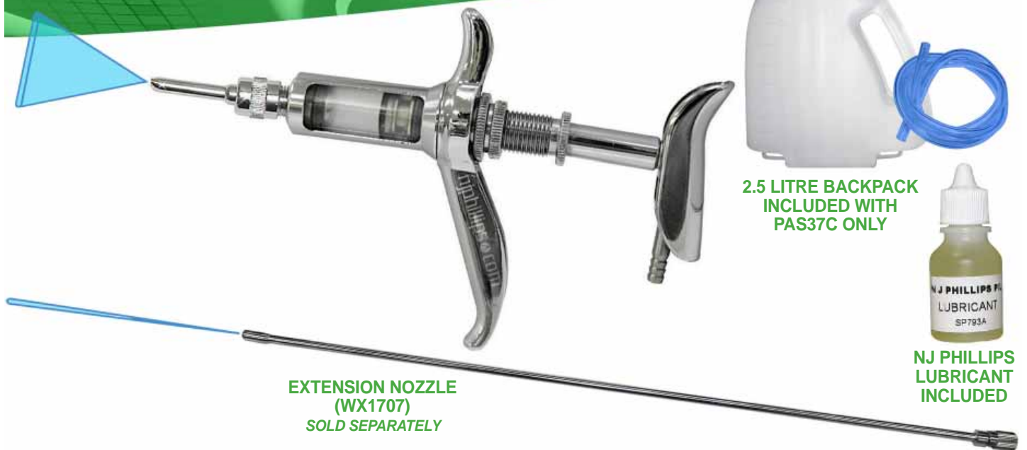
EXTENSION NOZZLE (WX1707) SOLD SEPARATELY

(PAS118) (PAS37C includes 2.5 litre backpack)