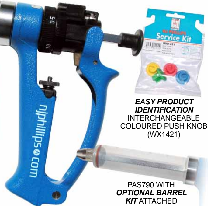
MODEL SHOWN: PAS790

EASY PRODUCT IDENTIFICATION INTERCHANGEABLE COLOURED PUSH KNOB (WX1421)