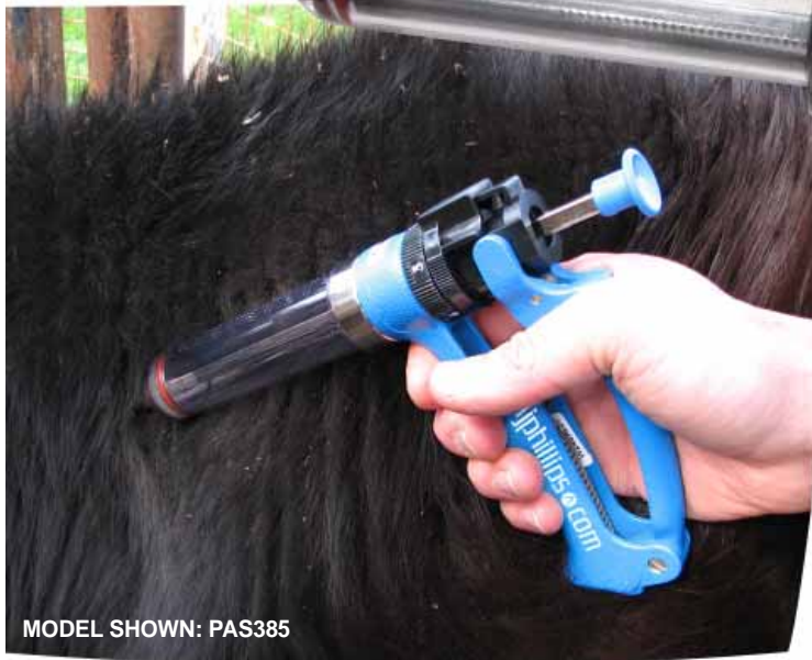
MODEL SHOWN: PAS385