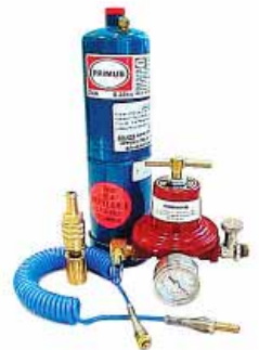
GAS CYLINDER (SUPPLIED AS REQUIRED), GAS REGULATOR, GAS LINE