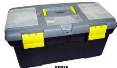
SP985 CARRY BOX