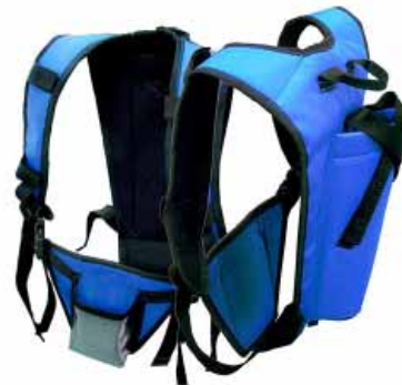
SP1173 POWERMASTER BACKPACK WITH BOTTLE HOLDER AND VACCINE POUCH